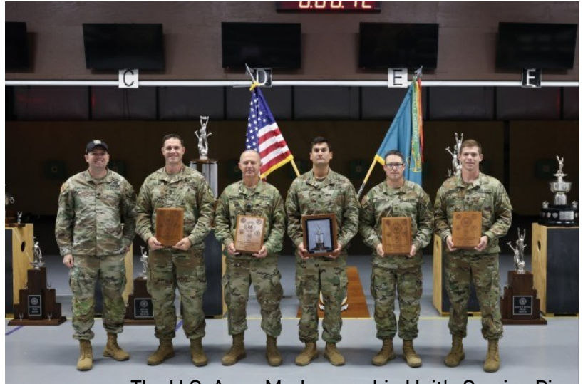
The U.S. Army Marksmanship Unit's Service Pistol Team wins the overall team championship and poses with their trophy at the 2024 Inter-service Pistol Championships at Fort Moore,