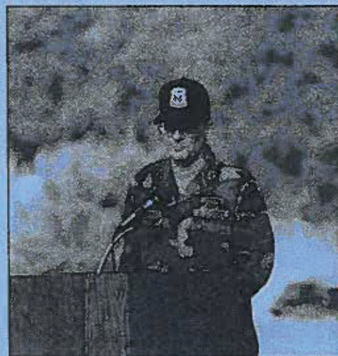
USAMU's New Commander